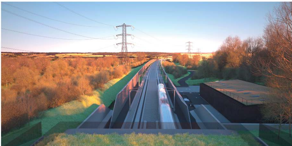
HS2 visualisation of the noise barriers at the south Green Tunnel portal

It was explained to the community that if the current situation persisted then there was limited noise mitigation anticipated in the Wendover North Cutting despite the “undertakings and assurances” in the HS2 act. The alternative was for WHS2 to continue to push for trackside noise barriers, tree planting and some further speed reductions to ensure the impact of noise was properly mitigated. Of 103 respondents 97% want WHS2 to continue to push for this.